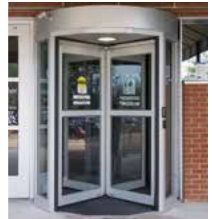
Round Canopy Segmented Drum