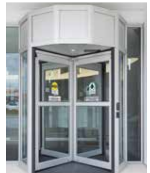
Segmented Canopy Segmented Drum