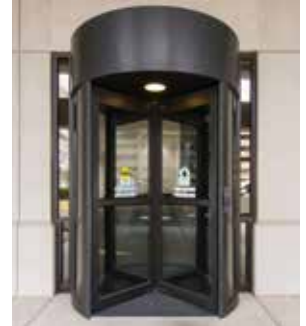
Round Canopy Round Drum