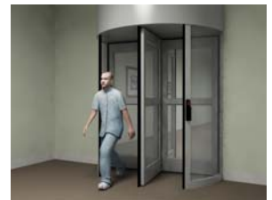
Seamless integration for new construction and retrofits