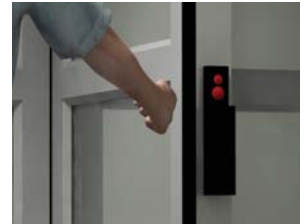
Your choice of access control