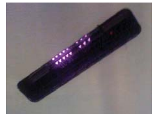
Advanced sensor technology